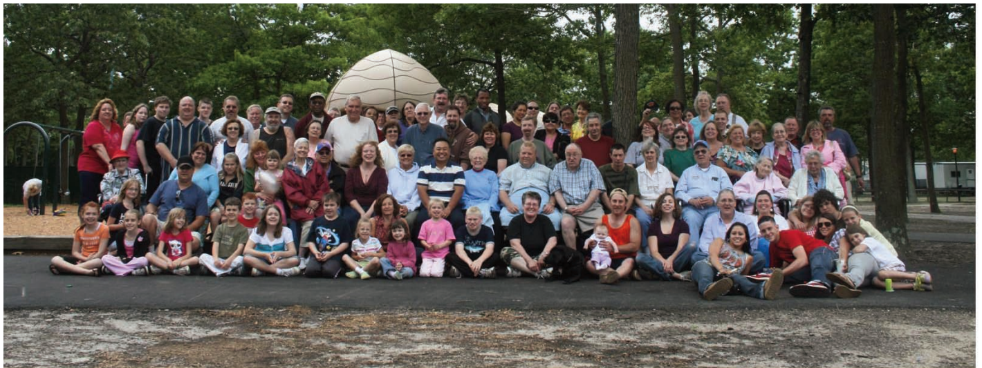
The United Methodist Church of Patchogue June 14th, 2009 Holtsville Ecology Center

Celebrate your life! Witness for your faith!