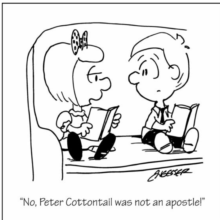
"No, Peter Cottontail was not an apostle!"