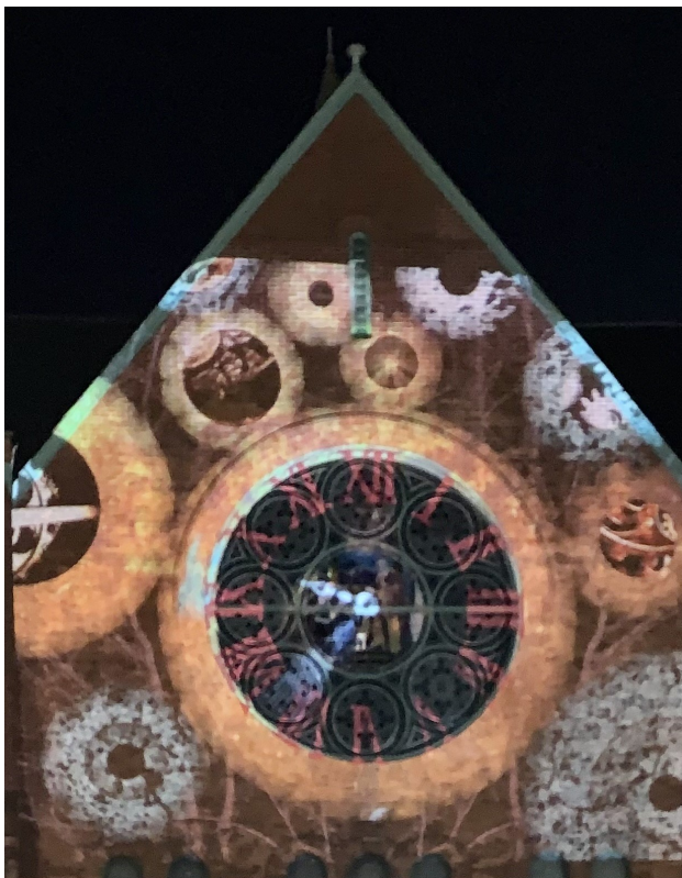
The Patchogue Arts Council featured our church in its Oct. 15-17 downtown light display.