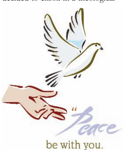
be with you. As the Father has sent Me, so I send you."