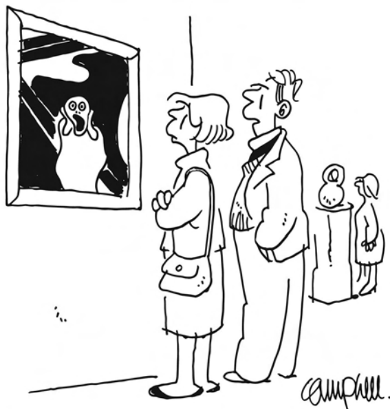
"It's titled 'Call for Volunteers.'"

130 MEDFORD AVE., (ROUTE 112) PATCHOGUE, NY 11772