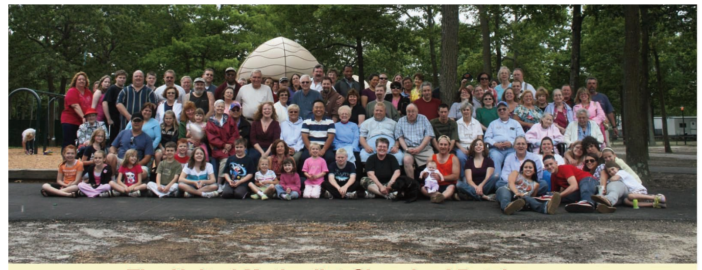
The United Methodist Church of Patchogue June 14th, 2009 Holtsville Ecology Center